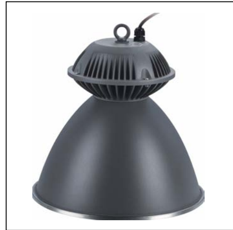
Dimensions @30 degree